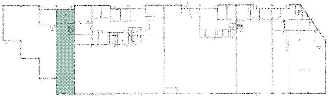
Plan not to scale

CB Richard Ellis, Inc. Broker Lic. 00409987